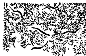
TYPHOID BACILLI. (From a pure culture.)