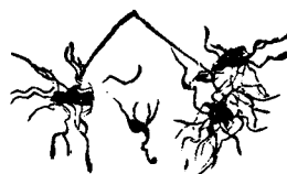
TYPHOID BACILLI. (Magnified 1,100 times.)